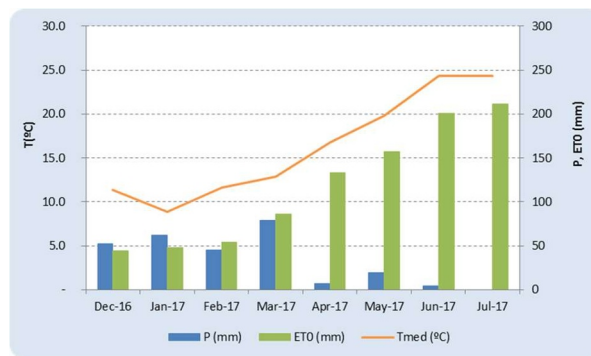
Figure 1. Monthly average daily temperature (Tmed), monthly precipitation (P) and monthly reference evapotranspiration (ET0) during the growing season from December 2016 to July 2017.

Given the climatic conditions of 2017, a very dry year, high water requirements were felt from the beginning of March, when the crop was entering the tillering stage (Fig. 1).