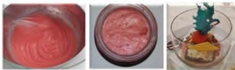
Fig. 3 Strawberry spreadable cream (from left to right) end of production filling and food pairing

- The result obtained for carbohydrates in the final prototype (SSC) was about half of the value reported for strawberry jam in TCA [37].