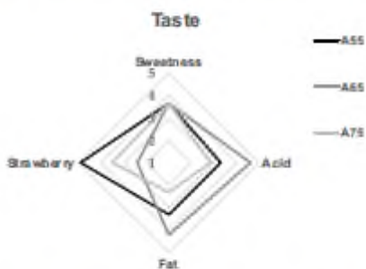
Fig. 1 Radar chart (a) appearance and texture, (b) flavours, and (c) taste attributes for A55 A65 and A75 prototypes (series no. 2)

Figure 2 presents the overall assessment results that confirms A55 as the final prototype.